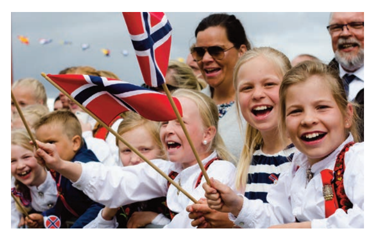
17TH OF MAY PARADE

Sunday, May 18, 2025 1 PM until 5 PM Celebrating 200 years of Norwegian Immigration 1825 - 2025