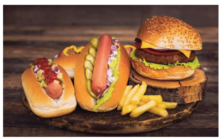
JUNE BBQ MEETING

Sunday, May 18, 2025 1 PM until 5 PM Celebrating 200 years of Norwegian Immigration 1825 - 2025